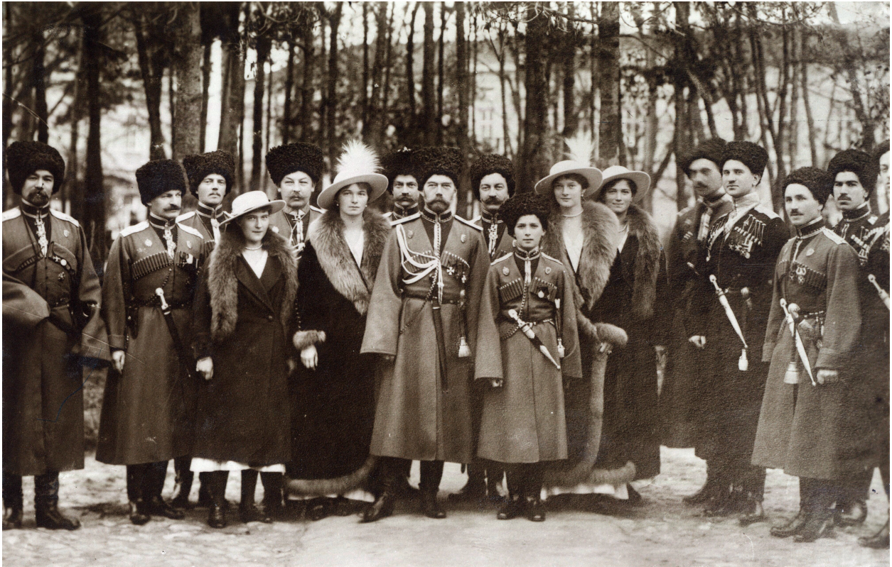
Left to Right: Anastasia, Olga, Nicholas II, Alexei, Tatiana and Maria.

we could go back in time and run that same newsreel, then we might be able to determine what this is all about and what the Romanovs have to do with Poincaré. I have an idea. Lights, please.