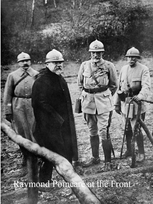
Raymond Poincaré at the Front

special garb for the purpose of the visit and for the publicity as well. Poincaré chose not to wear a uniform (even though he was entitled to the same as a Reserve Officer), instead he would dress in an odd outfit that became more memorable, more that of a chauffeur. A navy-blue overcoat with a peaked cap (sometimes a helmet) and his black riding boots, leggings. This was part of a political show, as the French President was personally known for his stiffness and reserved character.